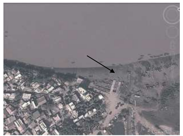
Figure 1: Sampling site

For the analysis of water parameters, the water samples were collected and preserved in pre-rinsed plastic bottles at monthly intervals during June 2011–May 2013 for the period of two years from the Dumas vicinity of Tapi estuary. Temperature and pH were analysed in situ and other parameters like dissolved oxygen (DO) conductivity, turbidity, nitrate, nitrite, phosphate, biochemical oxygen demand (BOD), chemical oxygen demand (COD), chloride and TPHC were analysed in the Research Laboratory, Department of Aquatic Biology, VNSGU, Surat. For the preservation and analysis of the water samples, the standard methods were followed [21,22].