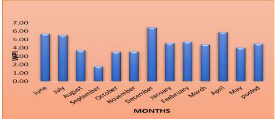
Fig. 4: WPI for the year 2011-12

The outcomes of this investigation revealed the quality assessment of the estuarine water body of Tapi River from Dumas areas for two consecutive years. This study highlighted poor water quality conditions of estuary in association with various physico-chemical parameters. The water quality variables showed fluctuations. Higher contaminations of components were found during pre and post monsoon then monsoon season. This might be due to the dilution of pollutants during monsoon season. This monitoring field study provides an informative preliminary data about water quality variables and helps to understand the quality status of water bodies. The Water quality index revealed that the estuarine water of the Tapi River was affected by increasing anthropogenic activities as well as agricultural and industrial runoff occurred in surrounding area. Hence, this area can degrade the water quality and making it unfit for public use. Similar findings on water quality of Tapi estuary were described earlier and it was considered as polluted with input sources from industries, domestic and anthropogenic activities [31-35]. Many reports are also available on the polluted aspect of physico-chemical features of various estuaries from India [36,37,38]. Water quality of Damanganga and Par Estuary was also found to be of poor quality and exhibited polluted nature of the estuary [39,40].