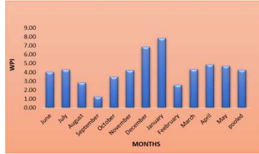
Fig. 5: WPI for the year 2012-13